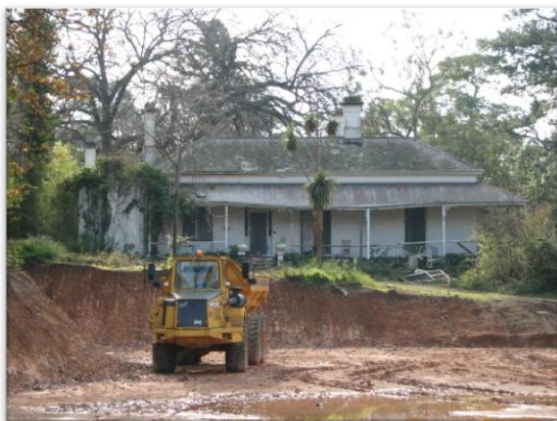
Decaying beauty: derelict house below the Rail Trail, Maroondah Highway, Lilydale.

Funding for the trail bridge has been announced repeatedly but this is the first sign of action. Did somebody mutter 'election year'?