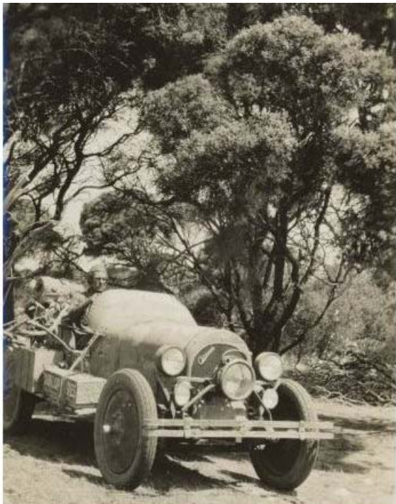
Above, Francis Birtles in the Oldsmobile 30 used for the Darwin to Adelaide overland speed record trip, 1924.

Turning from cycling to motoring, Birtles completed the first west-to-east crossing of Australia in 1912. In his Bean car 'The Sundowner', he set records for Melbourne to Darwin and Darwin to Sydney. By 1927 he had crossed the continent more than seventy times. He was the first person to drive from London to Melbourne, arriving in July 1928. His travelling time of nine months was not surpassed until 1955.