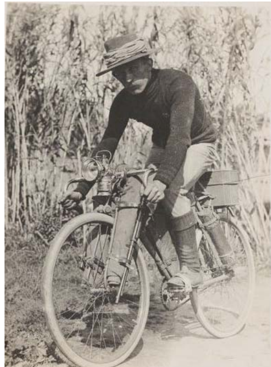
Above, Francis Birtles on his bicycle.

Birtles wrote a number of books on his adventures: Lonely Lands: Through the Heart of Australia , 1909; 3,500 miles across Australia in a Ford car , 1913; Darwin to Adelaide: Francis Birtles' history making journey , 1924 and Battle Fronts of the Outback , 1935.