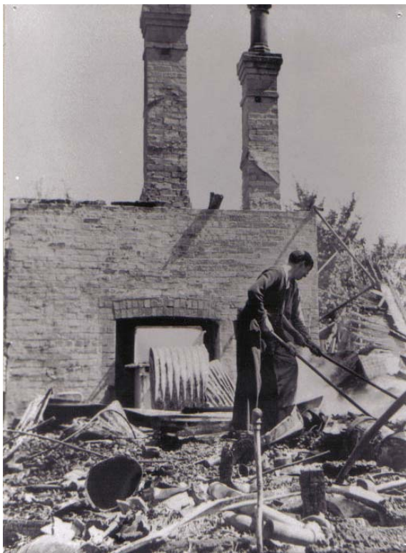
The ruins after the fire, March 1952. The stove is a later model than the cast iron monster remembered by Elliott.

I remember the rose garden, which was in need of a lot of attention but rather grand. There was a massive lime tree between it and the house. I remember some large camellias at the bottom of the lawn in front of the pine trees. The view of them from the house must have been from the verandah outside the Rhinds' apartment. They had a red setter