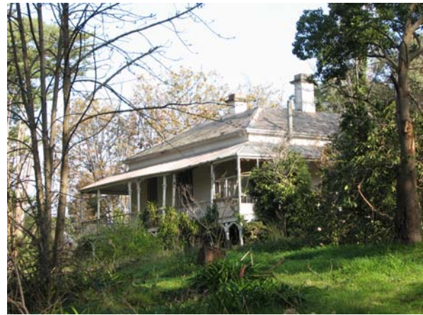
Above, the Manor House, 2010 (TP 29 & 30). Below, the house today.