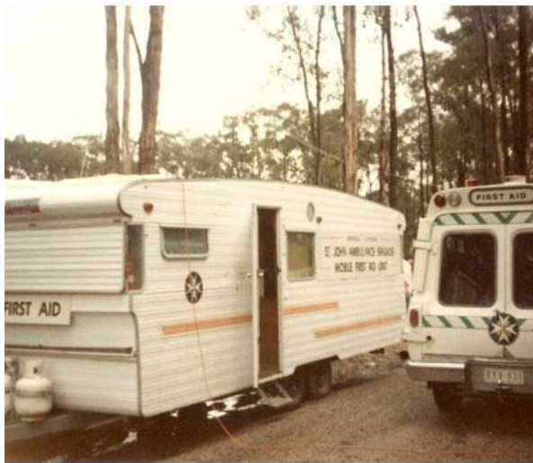
Above, St John vehicles Mt Evelyn 1 and Mt Evelyn 8 at Fraser National Park.