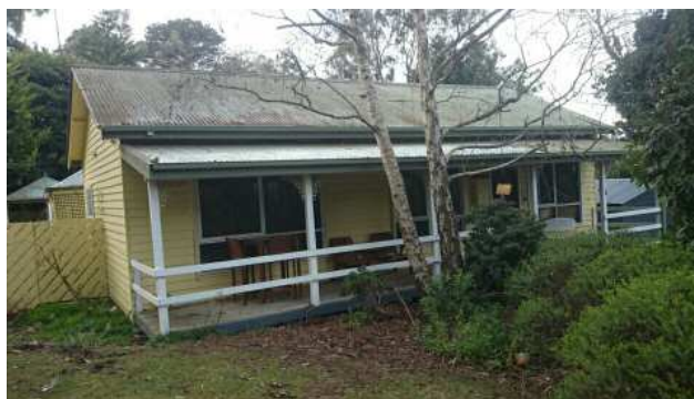
Above, the house as it is today.