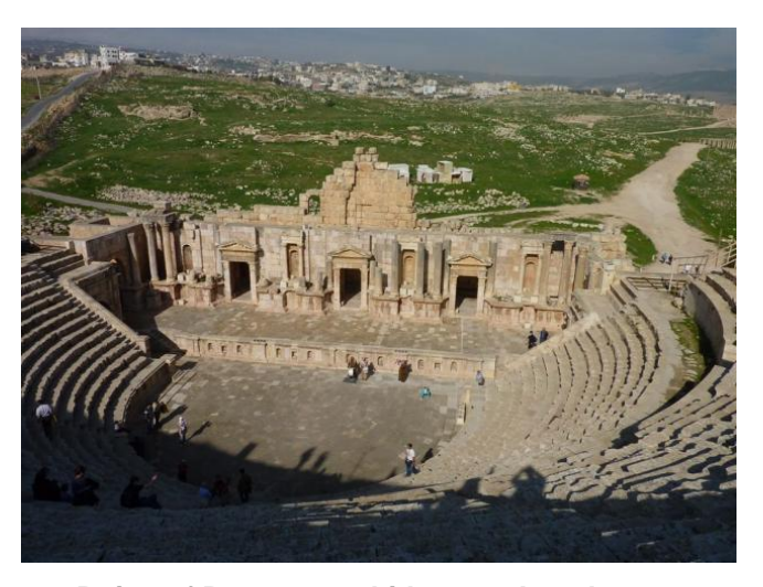
Ruins of Roman amphitheatre, Jerash.

One fascinating feature of the Madaba map was the 'pixelation' of the representations of living beings. Cubes of the pavement representing the sailors on the Dead Sea, or the lion pursuing a gazelle, had been lifted and put back in random order. This was possibly done during an era of iconoclasm under a 'famous' iconoclast, Yazid II (720-724), or perhaps later by Bedouins, according to the book I bought (Herbert Donner, The Mosaic Map of Madaba , Kok Pharos Publishing House, 1992).