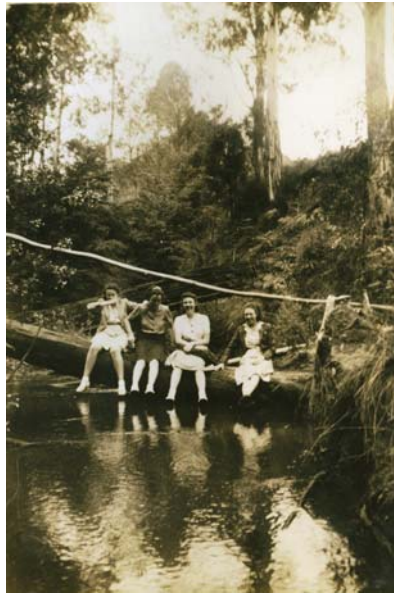
Above, the girls on a log at Mt Evelyn. The location is probably the Olinda Creek gully below St Mark's.