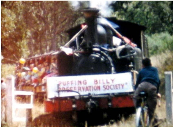
Puffing Billy approaches Belgrave on his last run from UFG.