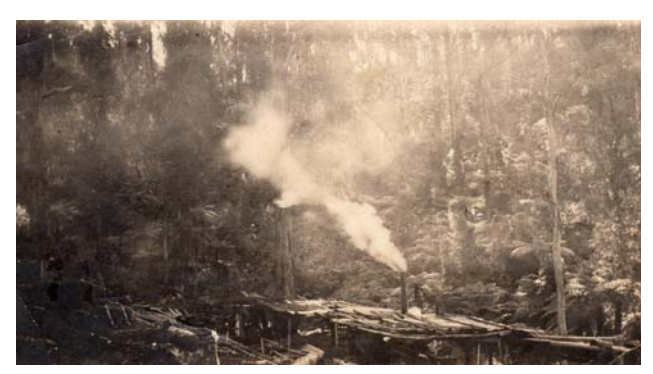
Above, Bladen and Hull's saw mill at the top of Inverness Road, Mt Evelyn.

Timber cutting continued in Mt Evelyn after the closure of Swift's saw mill until the mid-20<sup>th</sup> century. Apart from the huge quantities of wood cut for the Cave Hill lime kilns, it was mainly on a smaller scale, as shown by these photos of Bladen and Hull's saw mill on Inverness Road.